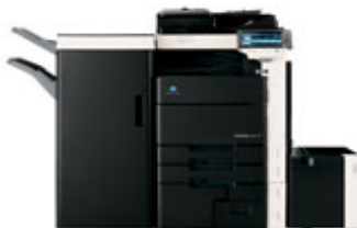
KONICA MINOLTA bizhub C552