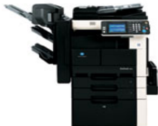
KONICA MINOLTA bizhub 362