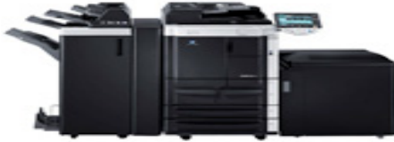
KONICA MINOLTA bizhub 751