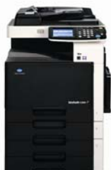
KONICA MINOLTA bizhub C200