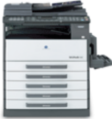
KONICA MINOLTA bizhub 181