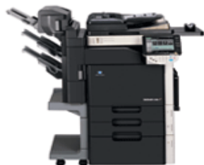
KONICA MINOLTA bizhub C353