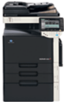
KONICA MINOLTA bizhub C203