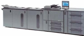
KONICA MINOLTA bizhub PRO 1050e