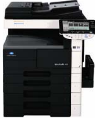
KONICA MINOLTA bizhub 361