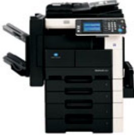
KONICA MINOLTA bizhub 282