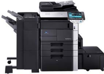
KONICA MINOLTA bizhub 421