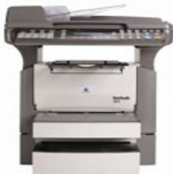
KONICA MINOLTA bizhub 161F