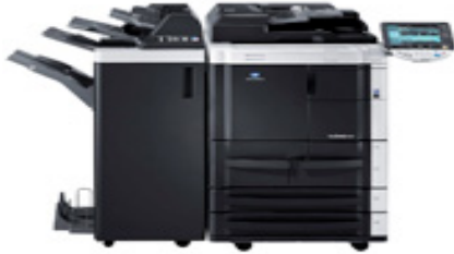
KONICA MINOLTA bizhub 601