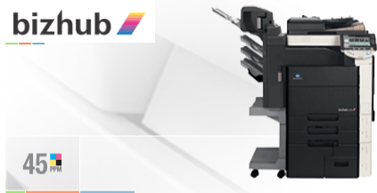
KONICA MINOLTA bizhub C451

bizhub C451 Full Color Printer/Copier/Scanner. Produces spectacular high speed color while allowing you to stores / shares documents with office simplicity and security. Powerful faxing and finishing options let you build an all-in-one document delivery solution with right size cost efficiency.