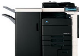
KONICA MINOLTA bizhub C652