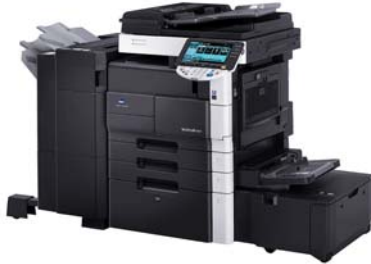
KONICA MINOLTA bizhub 501