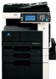
KONICA MINOLTA bizhub 222